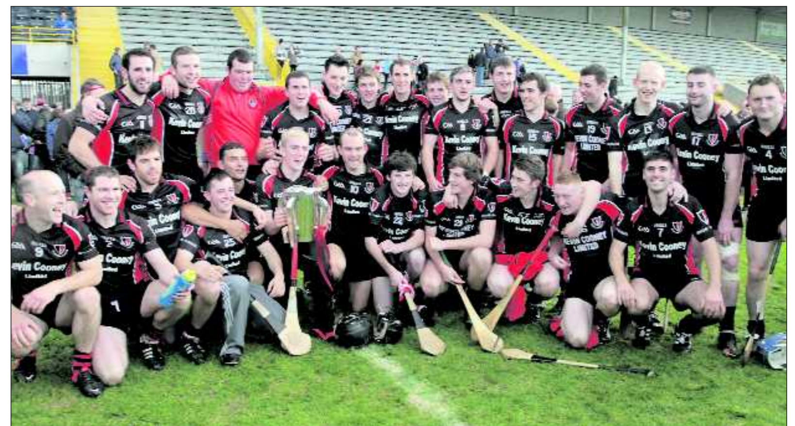
■ The Oulart-The Ballagh squad celebrate after making hurling history with a fifth Senior title on the trot.